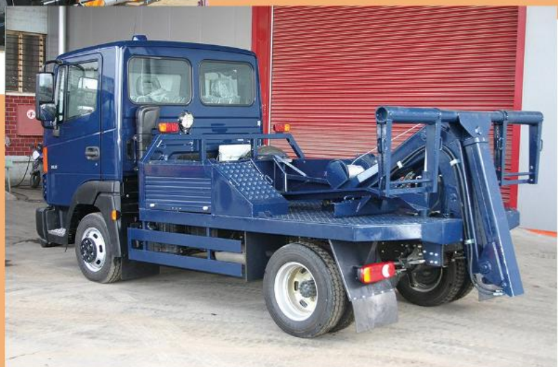
Road Assistance & Cranes