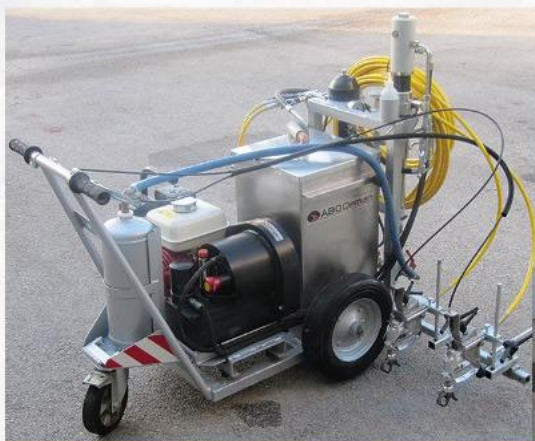
Self Propelled Units