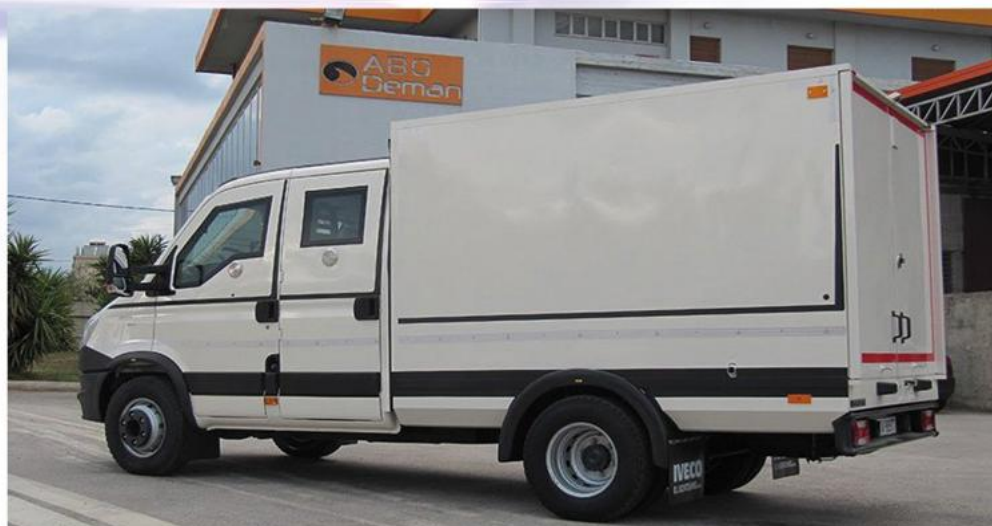
Cash Transit Transport