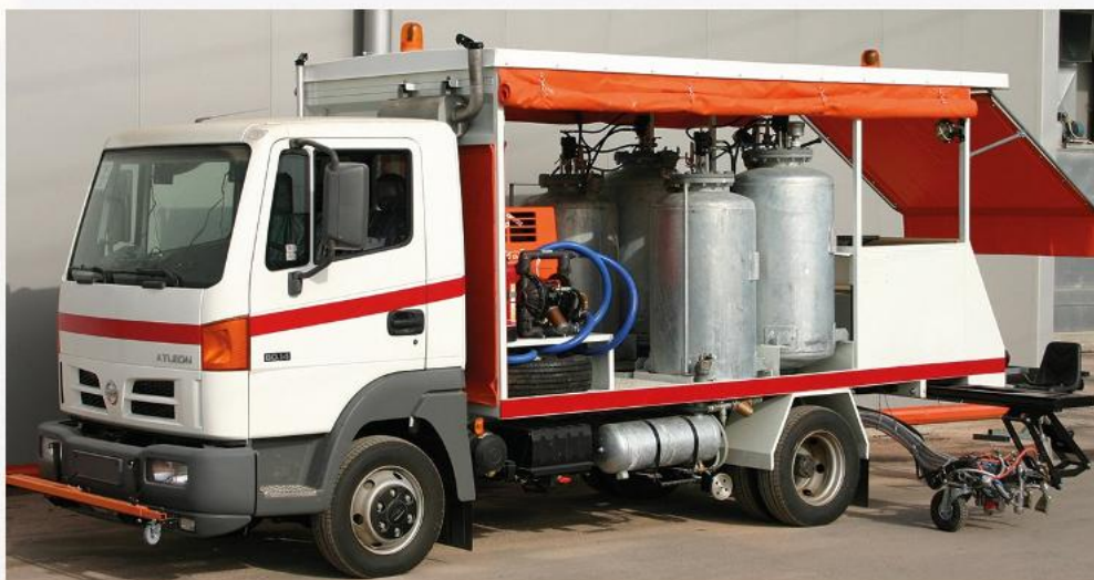
Air Spray System