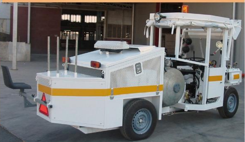
Walk Behind Machines