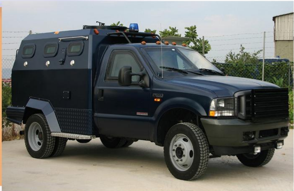
EKAM Type Armored Truck