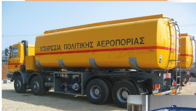
Port & Airport Refuel Service