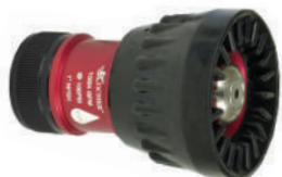
NZ009 1" NPSH 10 to 24 GPM