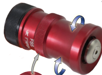
NZ008 1" NPSH 10 to 25 GPM