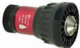
NZ015 1" NPSH 20 to 60 GPM