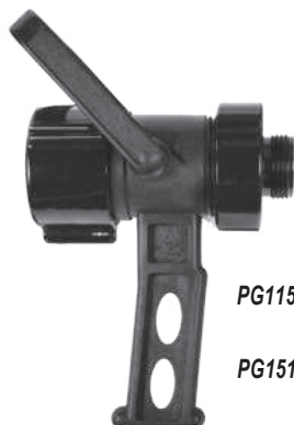
PG11 / PG115