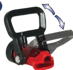
NZ027 Adjustable Fan Stream Nozzle Bail Handle creates either a Wide Band or Smooth Bore reaching distances up to 80 ft.

4 Spray diameters: 5/16", 1/4", 3/16", 1/8" offers you different volumes. Just rotate the tip to the desired setting.