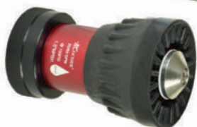
NZ012 1.5" NPSH 20 to 60 GPM